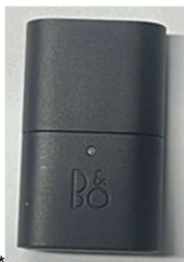
* Product may have different colour variations

Equipment: Dongle A Brand: Bang & Olufsen Marketing Name: Beocom Link A Model Name: Beocom Link A Object of equipment: